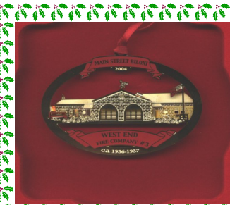
2004 West End Fire Company #3 $25