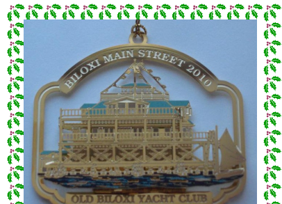
2010 The Old Biloxi Yacht Club $25