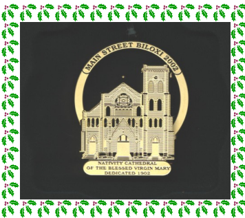
2002 Nativity Cathedral of the Blessed Virgin Mary $25