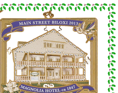
2013 The Magnolia Hotel $20