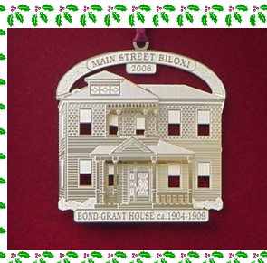
2006 Bond Grant House $25