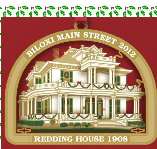
2012 The Redding House $25