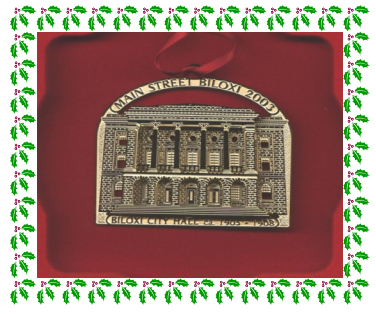
2003 Biloxi City Hall $25