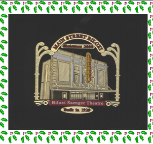
2000 Saenger- Theatre $25