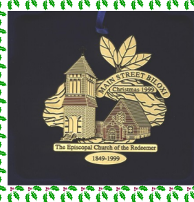
1999 Church of the Redeemer $25