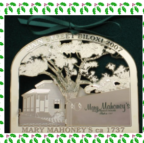
2007 Mary Mahoney's $25