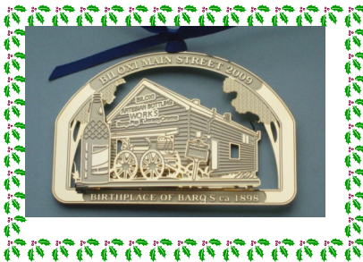
2009 Barq's Birthplace $25