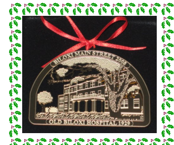
2008 Old Biloxi Hospital $25