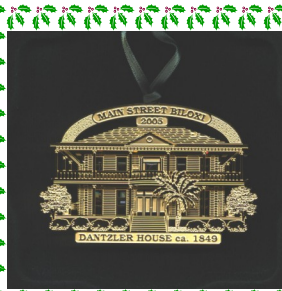
2005 Dantzler House $25