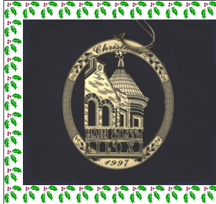
1997 Main Street $25

BUY ALL SEVENTEEN ORNAMENTS FOR ONLY $340