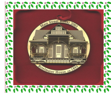
2001 Brielmier House $25