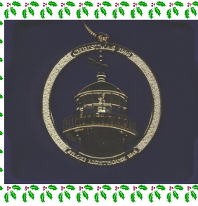
1998 Biloxi Lighthouse $25